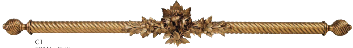
C1 20"W x 8¾"H 155 Antique pictured with WW201 finials and 225TR pole

standard crests attach to pole with L-bracket or attach to wall with custom H-bracket