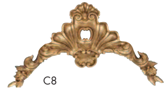
C8 27½"W x 15¼"H 155 Antique

Crests are versatile decorative tools that can be used in a variety of creative ways. Here are three ideas.