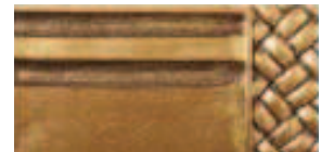
750 Polished Gold