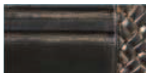
330 Bronze with Black