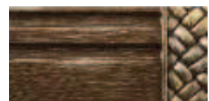
770 Bronze Patina