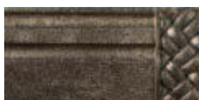
129B Antique Steel w/Black Highlights