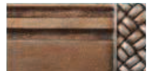
760 Rustic Iron