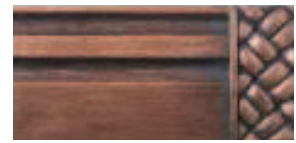
730 Rose Gold