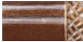
200 Walnut Gold with Gray Accents