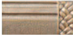
150 Gray with Gold