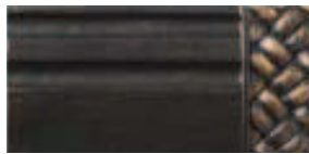
110 Flat Black with Gold