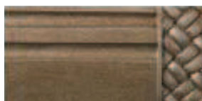
129 Antique Steel