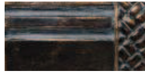
620 Weathered Iron