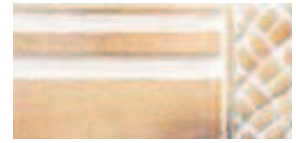
720 Tawny Oak