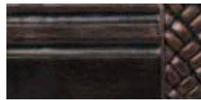
640 Oil Rubbed Bronze