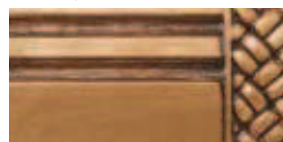
680 Aged Gold