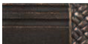
350G Statuary Bronze with Gold