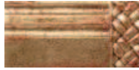
600 Gilded Red