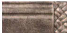
250B Platinum w/Black Highlights