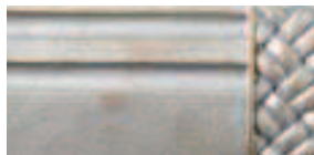
112 Silver with Gold