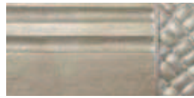
630 Ash Gray