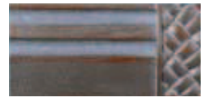
740 Smoky Mocha