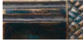
610 Cobalt Bronze