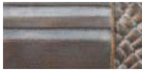
107 Bronze with Gold and Gray