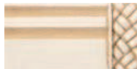
660 Antique White