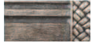
710 Tarnished Silver